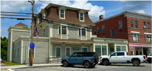
ACHS Whitefield 14 King Square | 603-837-2333