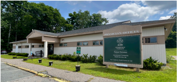
ACHS Woodsville 79 Swiftware Road | 603-747-3740